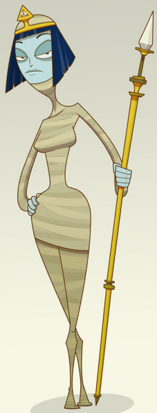
Isesi the Undead

Oh yeah, and some hieroglyphics depict her as a total mummy babe! Which is why Rockwell has a secret crush on her, but don't tell anyone.