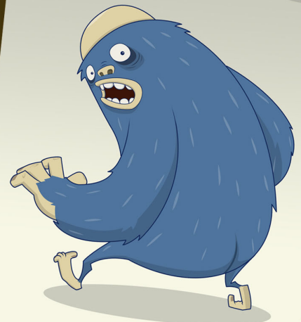
Freddy the Yeti

Freddy the Yeti is an arctic creature who has recently relocated to Omega City in the hopes of making it big. Unfortunately for Freddy he's balding, his feet are too big and his breath smells bad, which makes most respectable people reluctant to hire him. Combine this with a short yeti temper and well... you can see why Freddy has an easier time getting work from Mr. Moustache or whichever other villain in need of yeti muscle power (yeti or not, the bills still gotta get paid)!