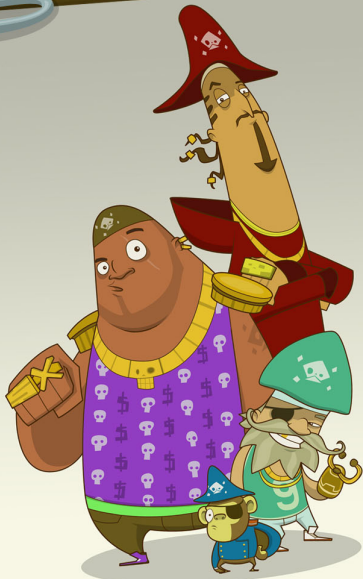
The Urban Pirates

Rude, loud and smelling of old dirty socks, the dreaded Urban Pirates are a ragtag team of vagabond city pirates. Lead by LONG JOE CHIMPERS, a small, silent monkey, these marauders love to cruise around town in their makeshift pirate-mobile, pillage the city subways, break into banks, and laugh really hard at sad movies (preferably if the theatre is full).